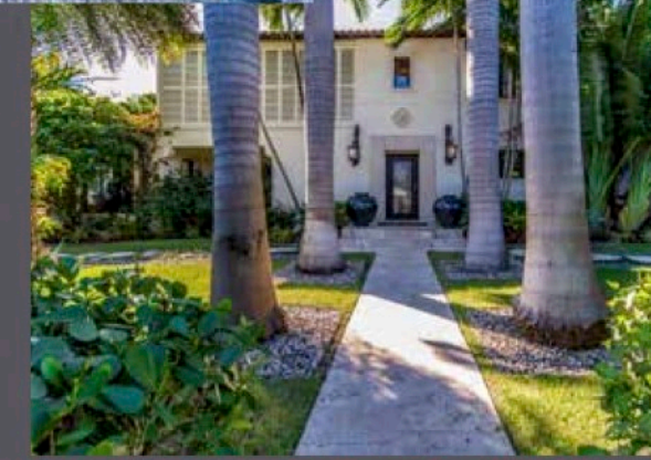
CONTEMPORARY ESTATE BY SAM ROBIN INTERIORS OVERSIZED LOT WITH POOL & LUSH GARDENS 4558 Alton Road - Mid Beach 6 Bedrooms + Media Room + 5.5 Bathrooms + Powder Walled & Gated for Total Privacy on 12,880 sf LOT $2,250,000