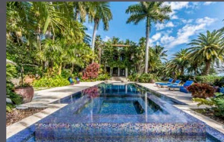
THE "GRAND DAME" ESTATE OF PALM ISLAND ON 3/4 ACRE IN THE HEART OF SOUTH BEACH 16 Palm Avenue - Palm Island 6 Bedrooms + 6.5 Bathrooms + Service Quarters 225 ft of Waterfront + Downtown Views $21,900,000

PROFESSIONALLY DESIGNED MIAMI BEACH LUXURY VILLAS AT ALL PRICE POINTS