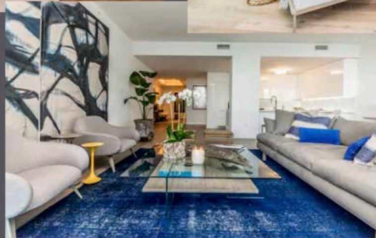
ENTERTAINER'S DREAM PENTHOUSE WITH OPEN FLOORPLAN PRIVATE ROOFTOP POOL + DECK DESIGNED BY ENZO ENEA Marea Penthouse 2 3 Bedrooms + 3.5 Bathrooms + Private Foyer 2 Story Designer Furnished Turnkey with Direct Bay Views $6,950,000