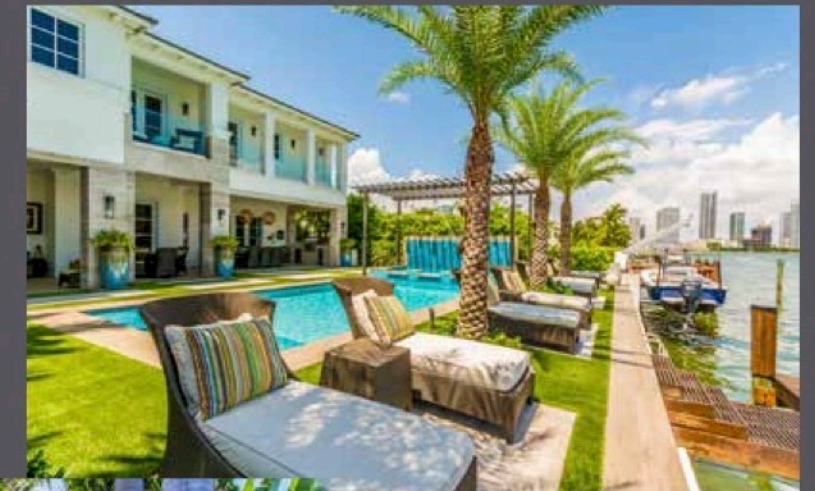
CARIBBEAN CHIC FAMILY HOME IN PRIME LOCATION BOATER'S DREAM WITH A RELAXED RESORT LIFESTYLE 1021 N Venetian Drive - Venetian Islands 7 Bedrooms + 7.5 Bathrooms 65 feet on Open Bay Waters + Ipe Wood Dock $9,600,000